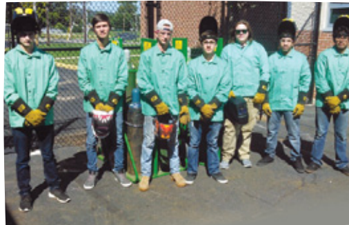
High school students enrolled in our welding program.

Through utilization of a School Intervention